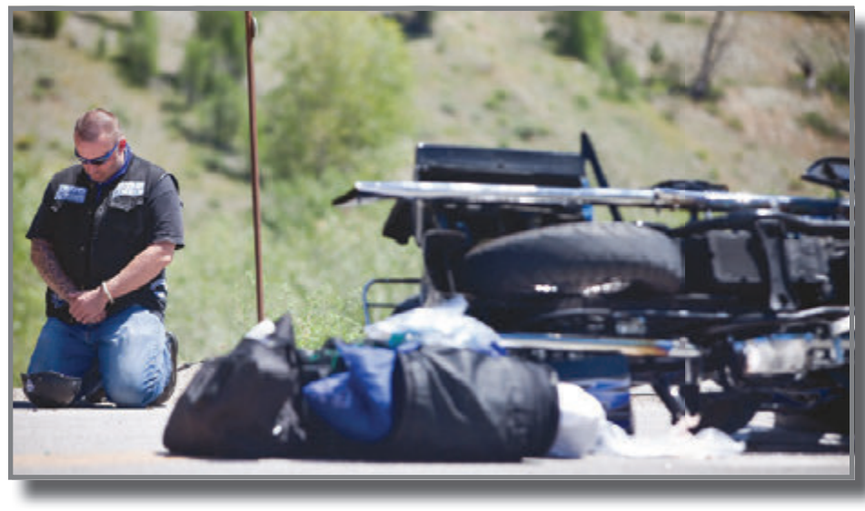
SECOND PLACE, best breaking news photo, non-daily division, circulation 5,000 - 9,999

Entries will be judged on human-interest, effectiveness and appeal to reader interest.