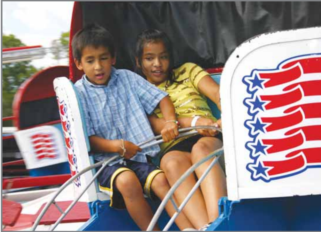
CLEVELANDS AT THE FAIR—?????. (FEATURE)

PAT MCKNIGHT | BANNER JOURNAL, BLACK RIVER FALLS, WI