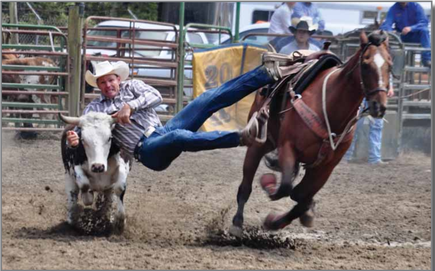
STEER WRESTLING —Steer wrestling at the 2012 Shoreline Riders rodeo Saturday and Sunday, July 28 & 29. (SPORTS)