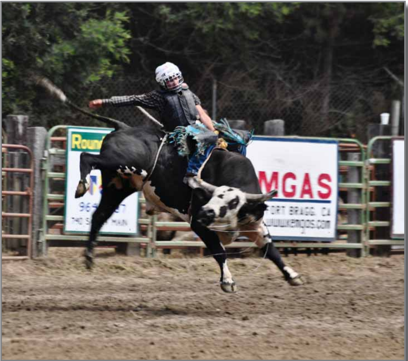
BULL RIDING —Bull riding at the 2012 Shoreline Riders rodeo Saturday and Sunday, July 28 and 29. (SPORTS)