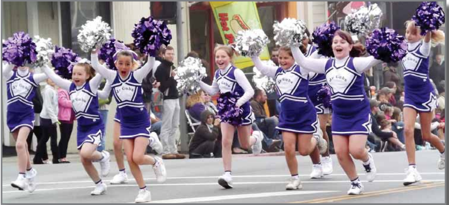
PARADE —The Junior Cubs cheerleaders performed in the Paul Bunyan Labor Day Parade. (SPORTS)