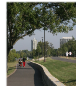
River Parks Trails