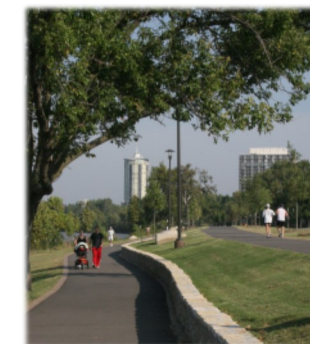
River Parks Trails