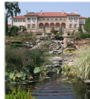
Philbrook Museum of Art

The Philbrook Museum of Art is an Italian Renaissance villa built by oilman Waite Phillips in 1927. This impressive 72-room mansion and surrounding 23 acres of beautiful gardens is now home to one of America's finest art museums.