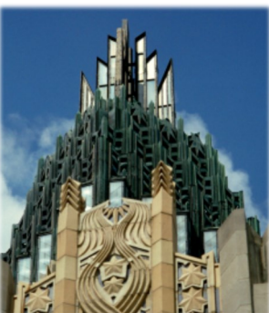
Boston Avenue Methodist Church