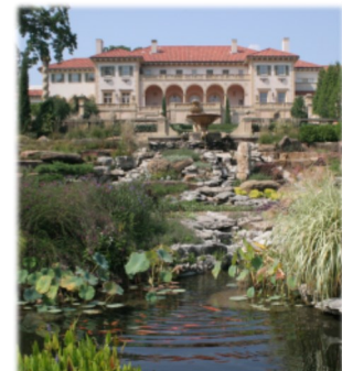
Philbrook Museum of Art

The Philbrook Museum of Art is an Italian Renaissance villa built by oilman Waite Phillips in 1927. This impressive 72-room mansion and surrounding 23 acres of beautiful gardens is now home to one of America's finest art museums.