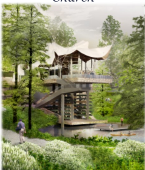
A Gathering Place for Tulsa

Find your own niche at River Parks . Currently, River Parks encompasses over 26 miles of paved trails, hundreds of acres of open and wooded areas, and activities for young and old alike. On the east bank of the river, adjacent to Riverside Drive, the trail stretches from 11th to 101st Streets. At 96th Street and Riverside, trail users can cross the river to Jenks or connect with the Creek Turnpike Trail and travel to Hunter Park and further east to Memorial Drive. At 11th Street, trail users can go north, connecting to the M. K. & T. Tulsa-Sand Springs "Katy" Trail on the former railroad right-of-way.