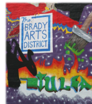
Brady Arts District

Home to primarily locally-owned eateries, the Brady Arts District is the place to experience the eclectic side of Tulsa. With classic hot dogs, hip cafés and four-star steakhouses, the Brady Arts District is one of Tulsa's hottest spots.