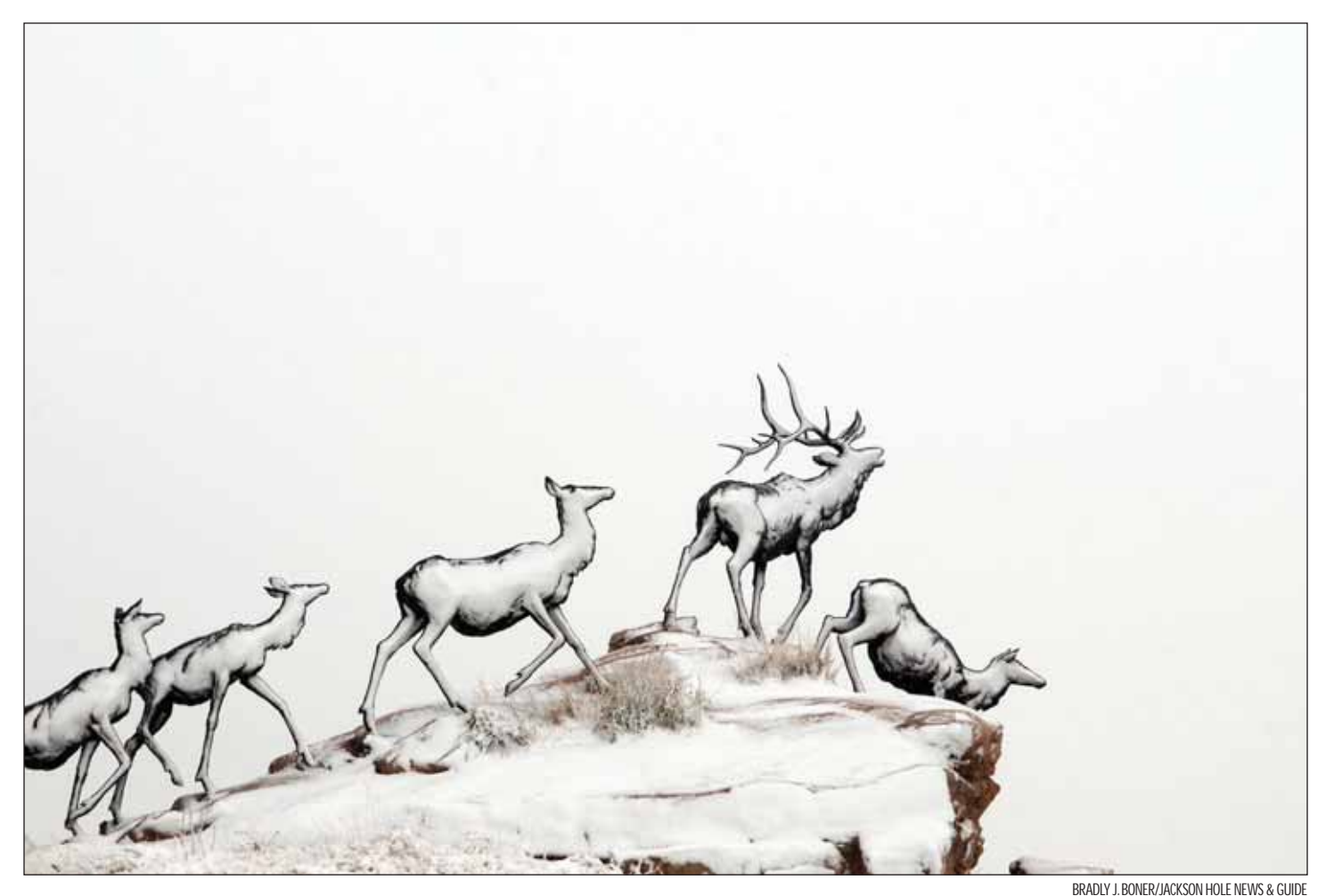
STATUE—Snow sticks to the bronze statue in front of the National Museum of Wildlife Art after the season's first winter storm system moved into Jackson Hole in early October. (FEATURE)