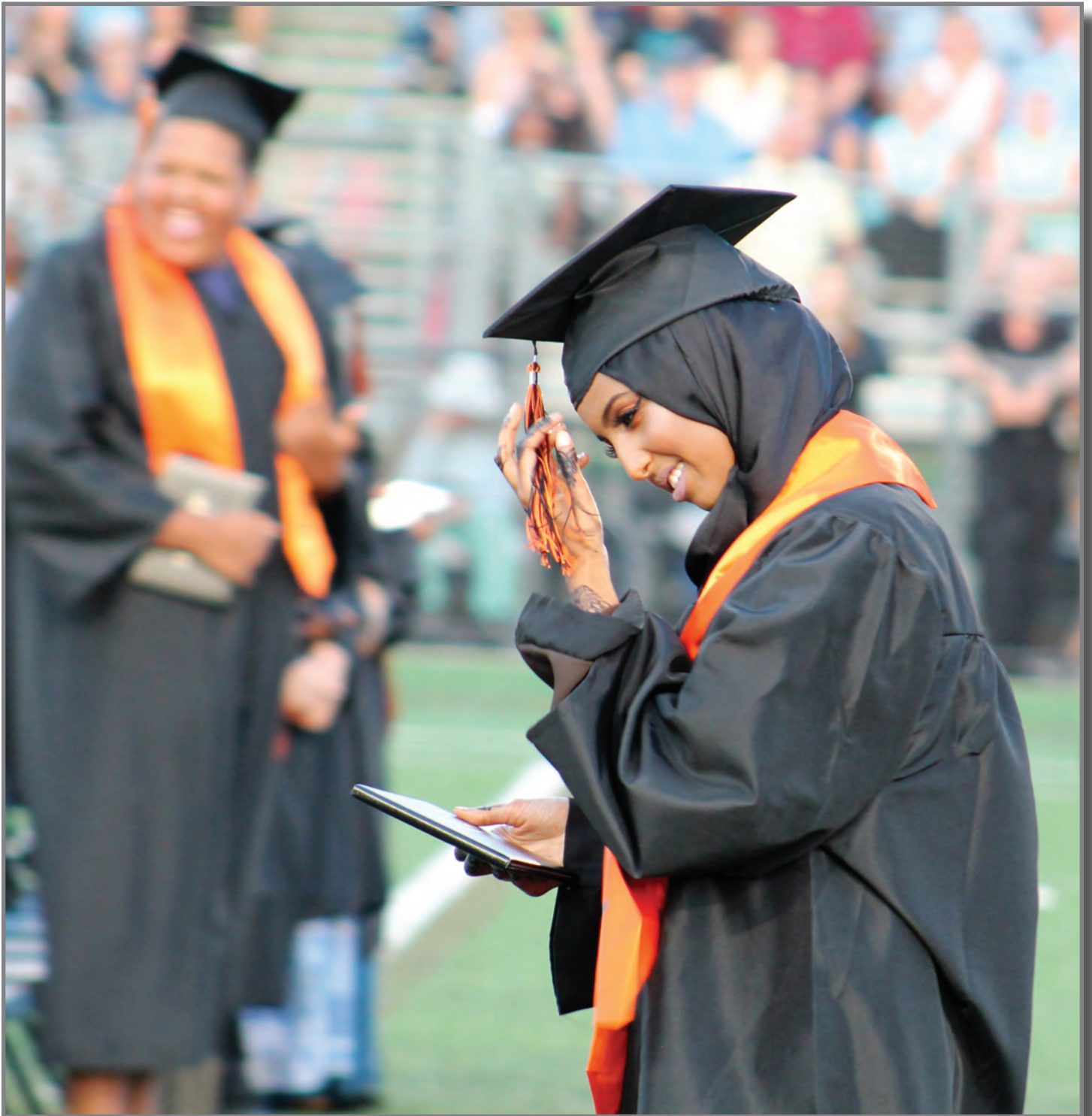
TASSEL SWITCH —A St. Louis Park High School graduate moves the tassel on her cap after receiving a diploma June 8. (NEWS)