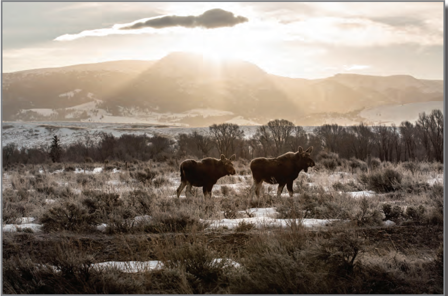
MOOSE —As the March sun rises over Sheep Mountain, two young moose pause while browsing sagebrush in Grand Teton National Park. (FEATURE)