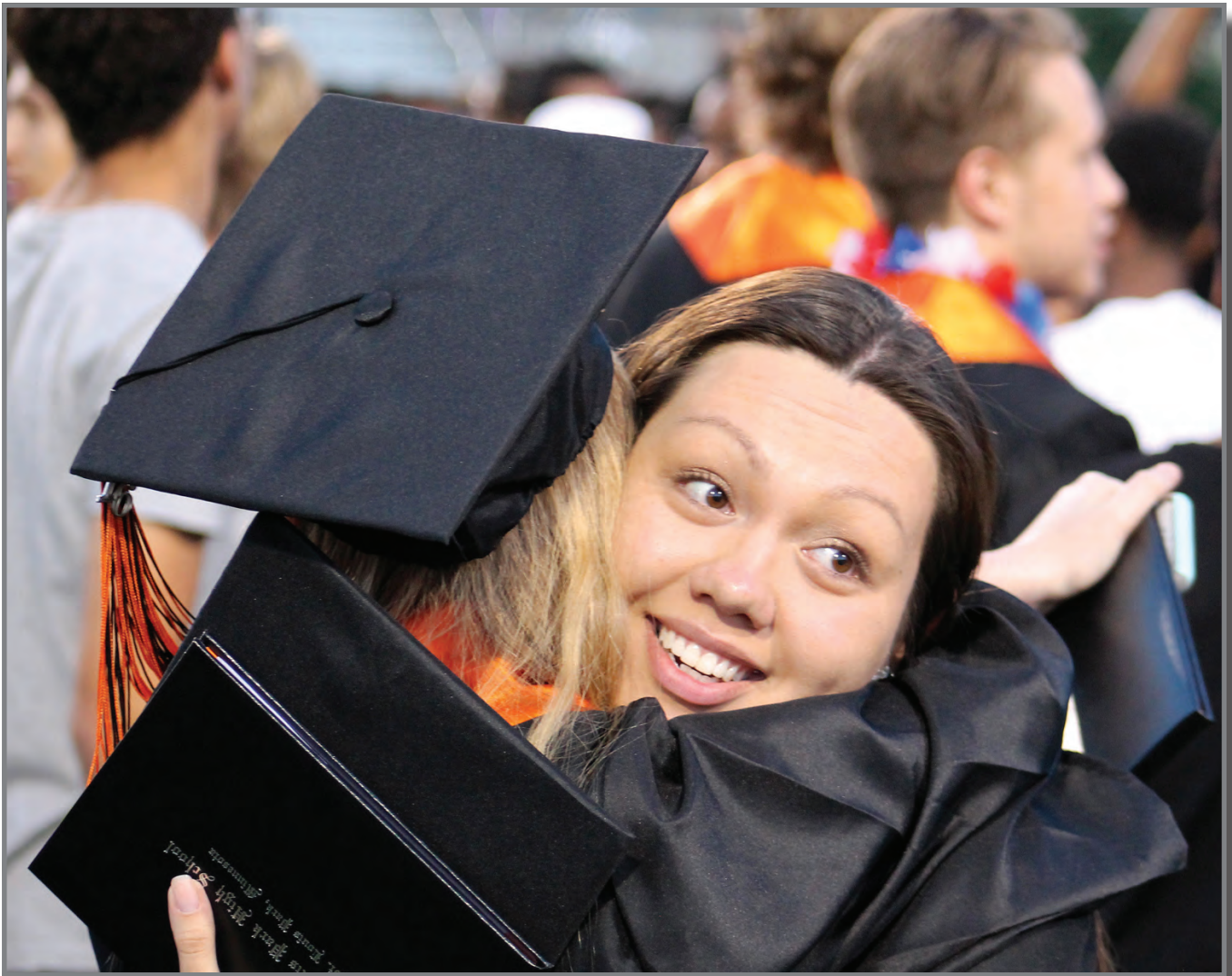
GRADUATION HUG —Students embrace after the St. Louis Park High School graduation ceremony June 8 at the school's stadium. (FEATURE)