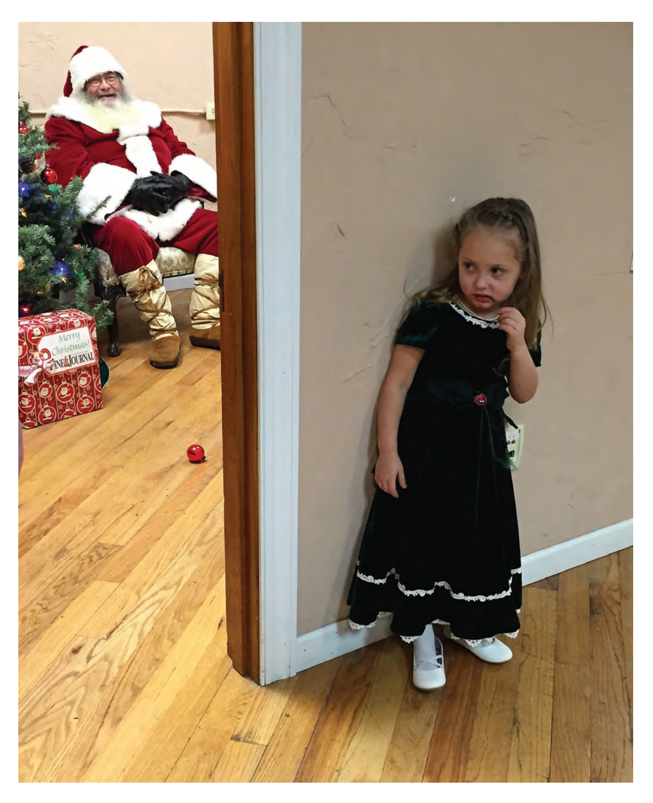
JANA PETERSON | PINE JOURNAL NEWSPAPER, CLOQUET, MN