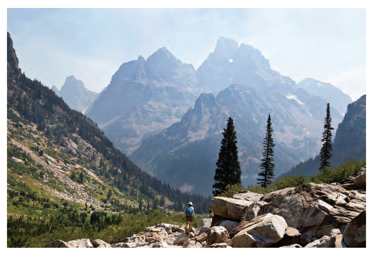
RUGILE KALADYTE | JACKSON HOLE NEWS&GUIDE

LAKE SOLITUDE—A hiker descends from Solitude Lake on August 23 in Grand Teton National Park. Hikers have the option of taking the Jenny Lake Trail around the south end of Jenny Lake, or taking the shuttle boat across the lake to the Cascade Canyon Trailhead. The boat cuts-off about 2.4 miles of walking each way. The round-trip length is approximately 15.3 miles with the shuttle boat. (FEATURE)