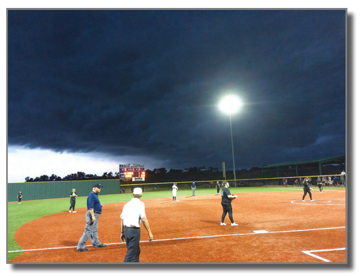
STORM STOPS GAME —The storm that arrived at Brock High School during the softball regional finals May 28 was a huge one that forced the post-ponement of game one. (SPORTS)