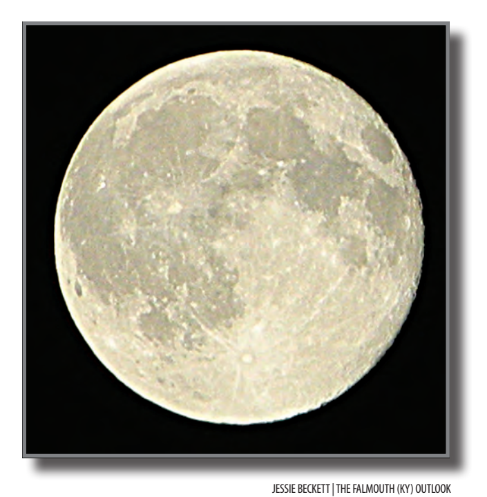
BLUE MOON —Blue Moon of Kentucky. (FEATURE)