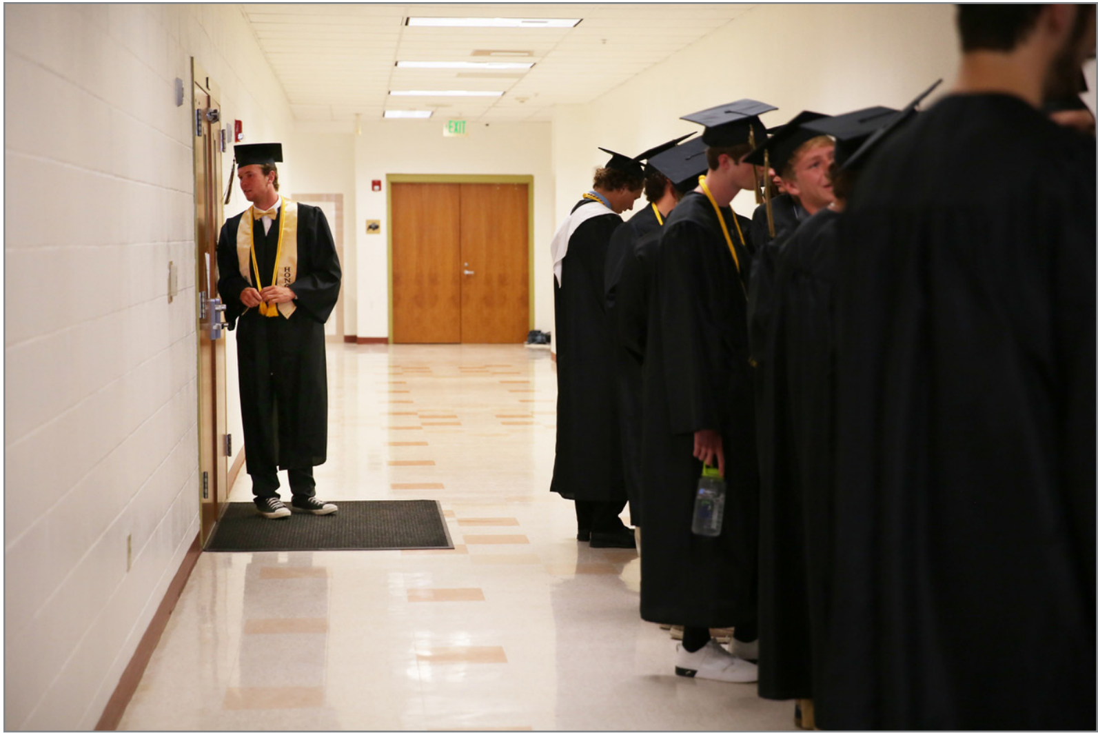
JESSI DODGE | BUFFALO (WYOMING) BULLETIN