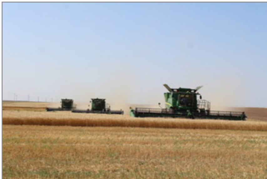
KAREN LIPSKA | PINE BLUFFS (WYOMING) POST