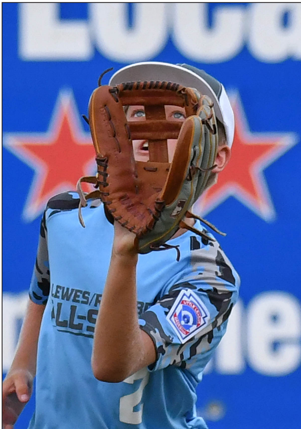
DAN COOK | CAPE GAZETTE (LEWES, DELAWARE)