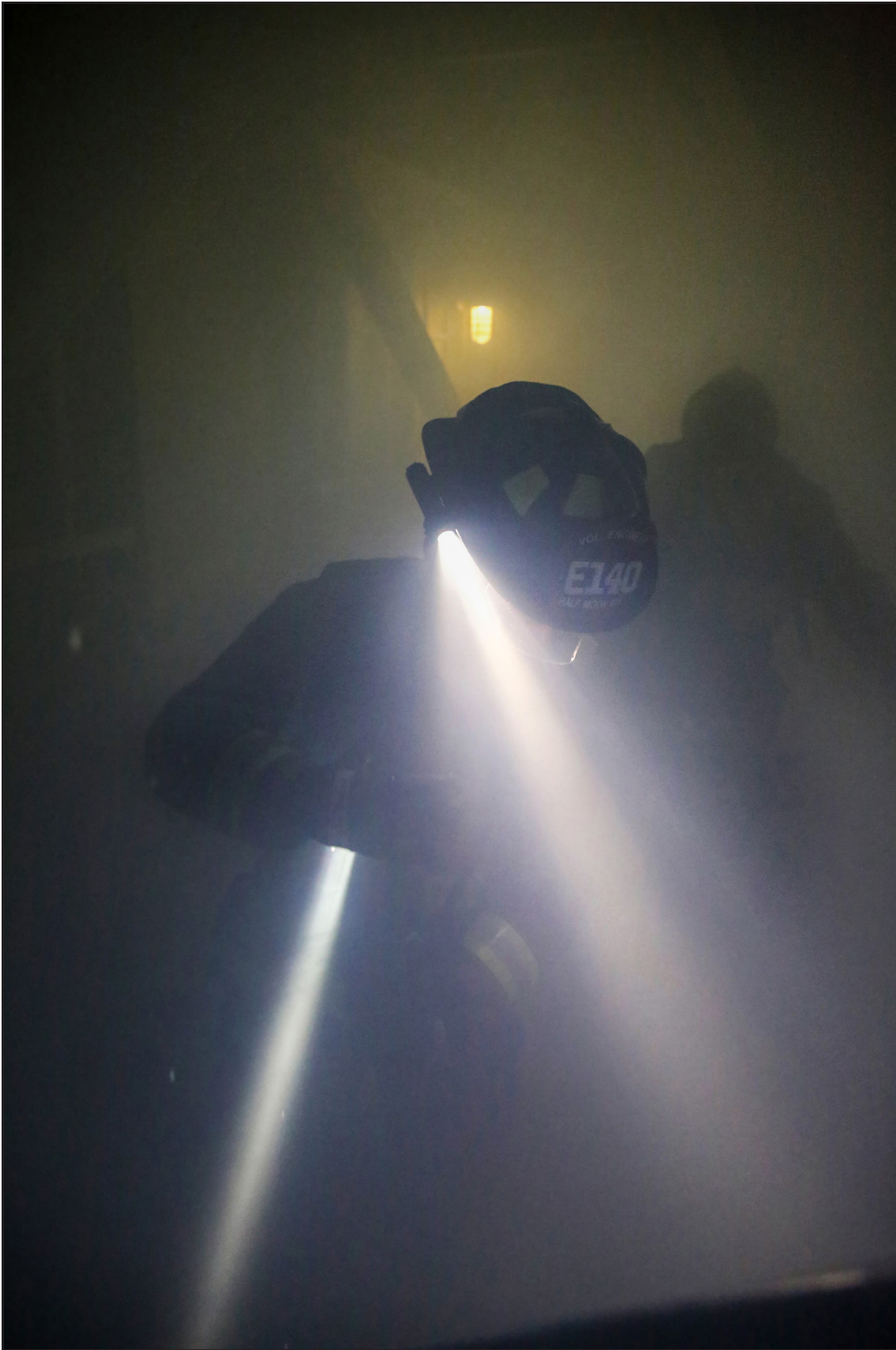
Half Moon Bay volunteer fire- fighter Zachery Perry clears rooms in a fire simulation exer- cises inside the training tower near headquarters on Main Street in downtown Half Moon Bay, Cali- fornia. (February 14, 2019)