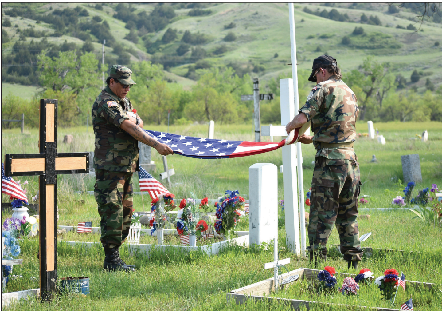
EAGLE BUTTE, SOUTH DAKOTA

Every year, Cheyenne River veterans observe Memorial Day on the traditional date of May 30. This year, veterans visited over 35 cemeteries and burial sites and at each one conducted a prayer, 21-gun salute, and played Taps. Look for more photos on page 9a.