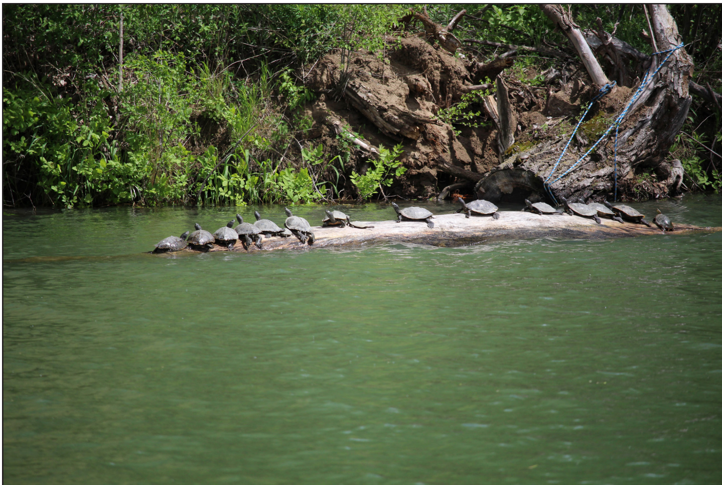
BETH FENNEL | DAKOTA DUNES / NORTH SIOUX CITY (SOUTH DAKOTA) TIMES

SUNLIGHT — With several rainy and dreary days, it's hard to see the beauty in Mother Nature. Wednesday, May 22 started out miserably with high winds and rainy conditions; however, by mid-afternoon the sun was peaking through the clouds. These 16 turtles took advantage of the sunlight and dried out on a log just off of the boat ramp on McCook Lake. Just goes to show, people can always find something magnificent even on the dreariest of days.